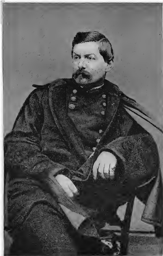
GENERAL GEORGE B. MCCLELLAN